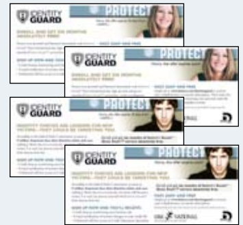
CO-BRANDED CHECK PACKAGE INSERTS

Branch reference guide —A guide for employees to help answer questions about IDENTITY GUARD.