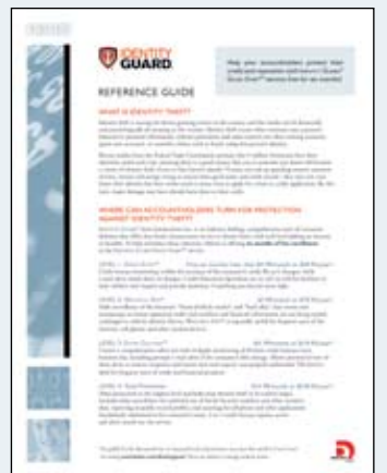
BRANCH REFERENCE GUIDE

Deluxe Financial Services 3680 Victoria Street North Shoreview, MN 55126