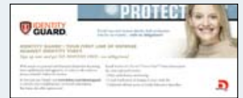
STATEMENT STUFFER/PROMOTIONAL FLYER